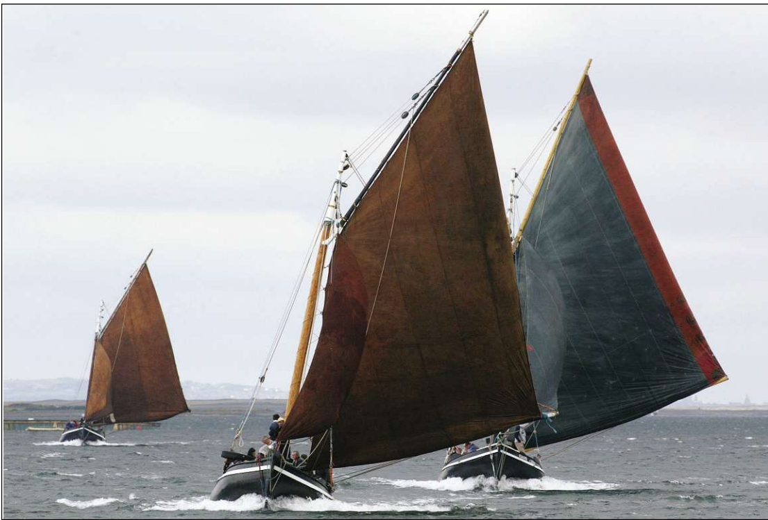
The Atlantic's swell: cruinniú na mbad – the 'meeting of the boats' – Galway hookers off Kinvara

Remember you don't have to understand every single word con-