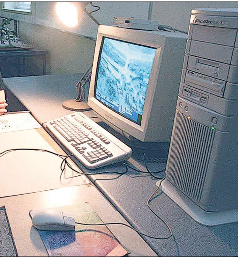
Using aerial photography for map making at a photogrametric work station in DIT, Bolton Street